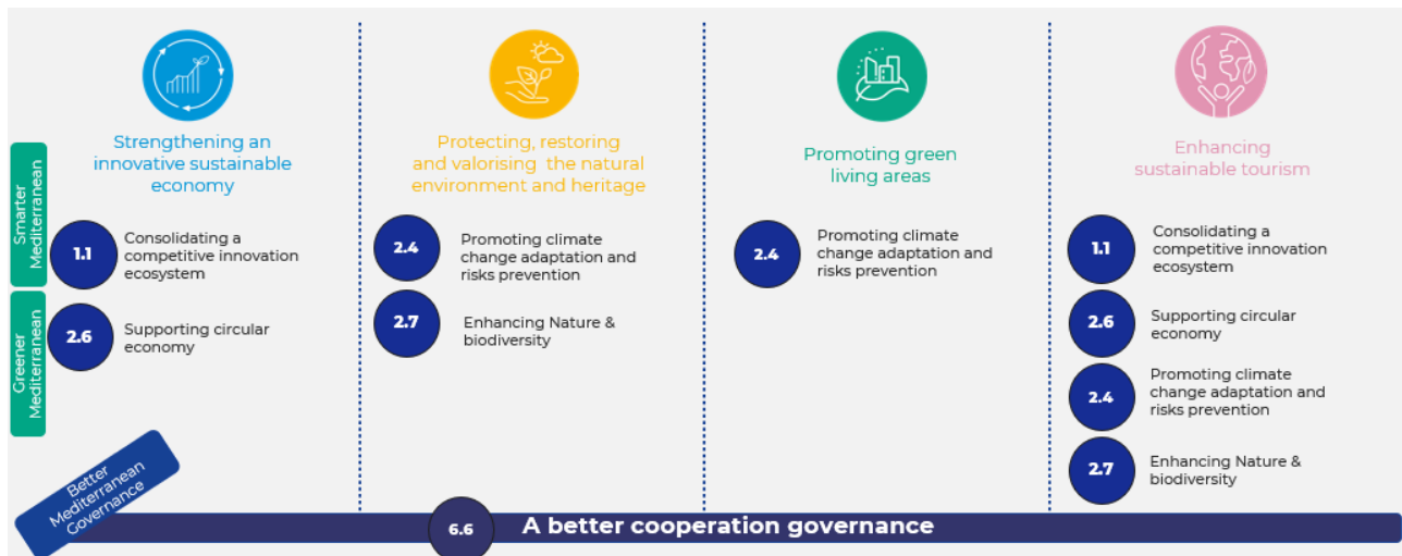
Illustration of the structure of the programme and types of projects: Priorities, Specific Objectives and Missions.

All the Thematic projects operating under each mission are supported by one Thematic community project and one Institutional Dialogue project.